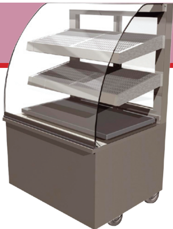
IMAGE SHOWN IS VH900-GO WITH FASCIA PANEL AS AN OPTIONAL EXTRA. REAR DOORS AS STANDARD.