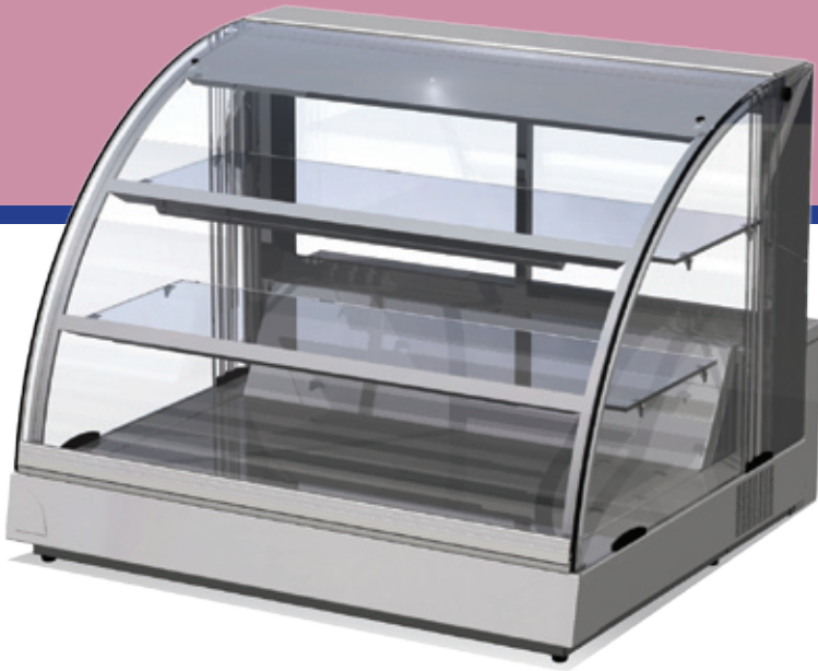
VISUAL SHOWS THE VCCT2 DISPLAY