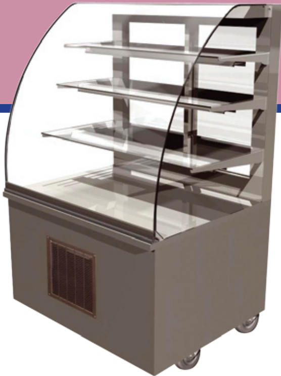
IMAGE SHOWN IS VC900-GO WITH FASCIA PANEL AS AN OPTIONAL EXTRA. REAR DOORS AS STANDARD.