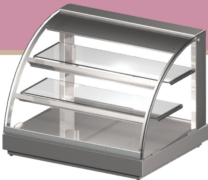
VISUAL SHOWS THE VACT2 DISPLAY