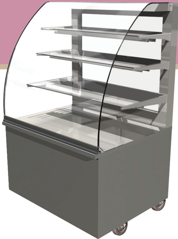
IMAGE SHOWN IS VA900-GO WITH FASCIA PANEL AS AN OPTIONAL EXTRA.