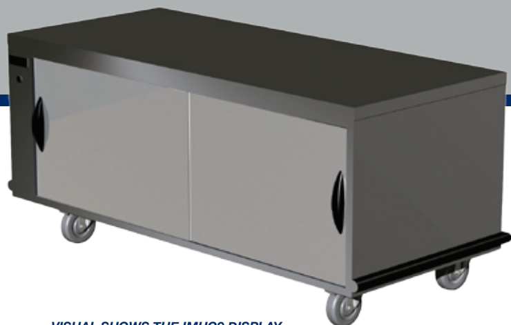
VISUAL SHOWS THE IMHC9 DISPLAY