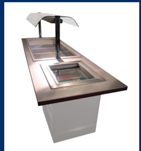
VISUAL SHOWS THE IICU2 (FRONT)

For more information on this product, please contact a member of our sales team or visit our website.