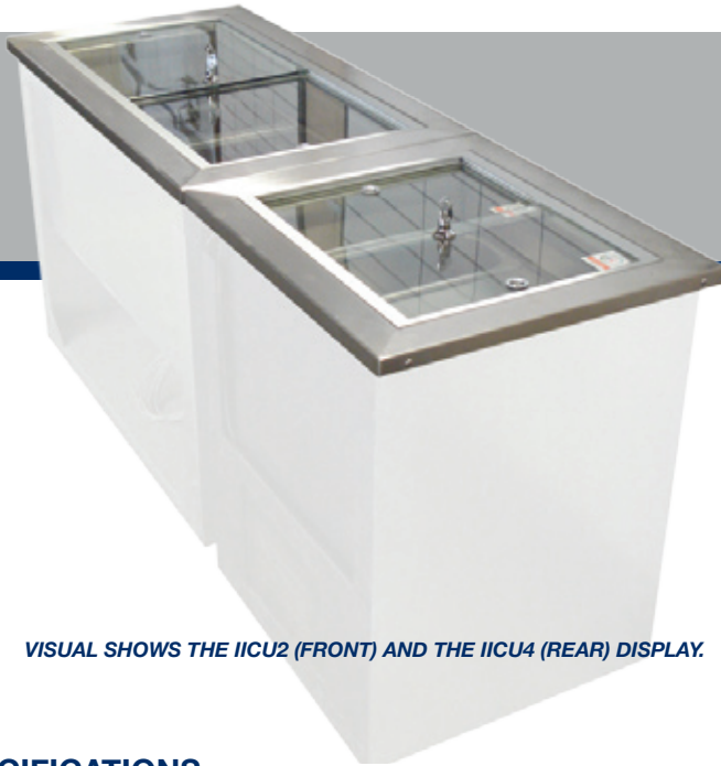
VISUAL SHOWS THE IICU2 (FRONT) AND THE IICU4 (REAR) DISPLAY.