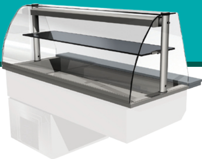
VISUAL SHOWS THE ICDL4-GO DISPLAY