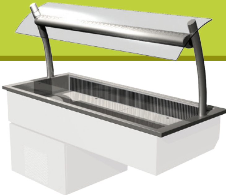
VISUAL SHOWS THE DCW4 DISPLAY