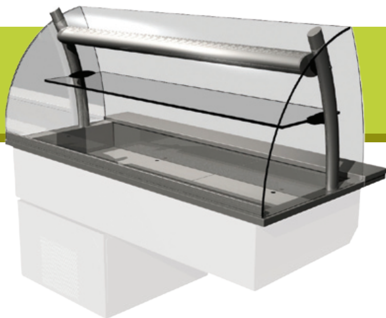
VISUAL SHOWS THE DCDL4-GO DISPLAY