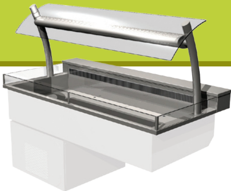
VISUAL SHOWS THE DCDK4-GO DISPLAY