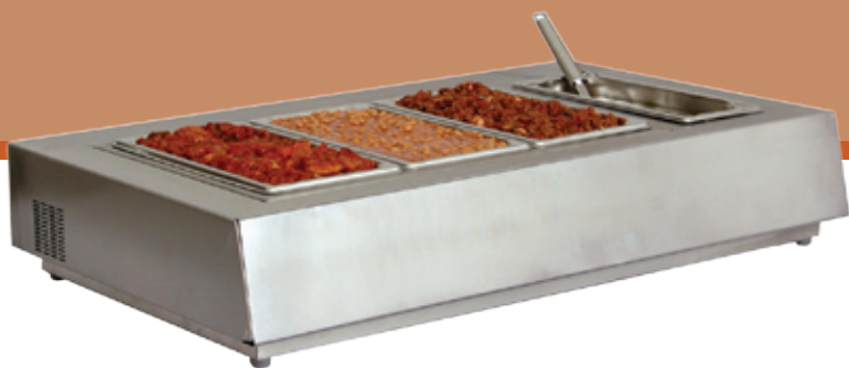
VISUAL SHOWS THE CHBM