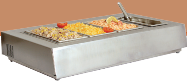
VISUAL SHOWS THE CCBM