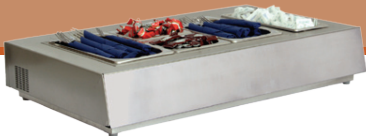
VISUAL SHOWS THE ACCU